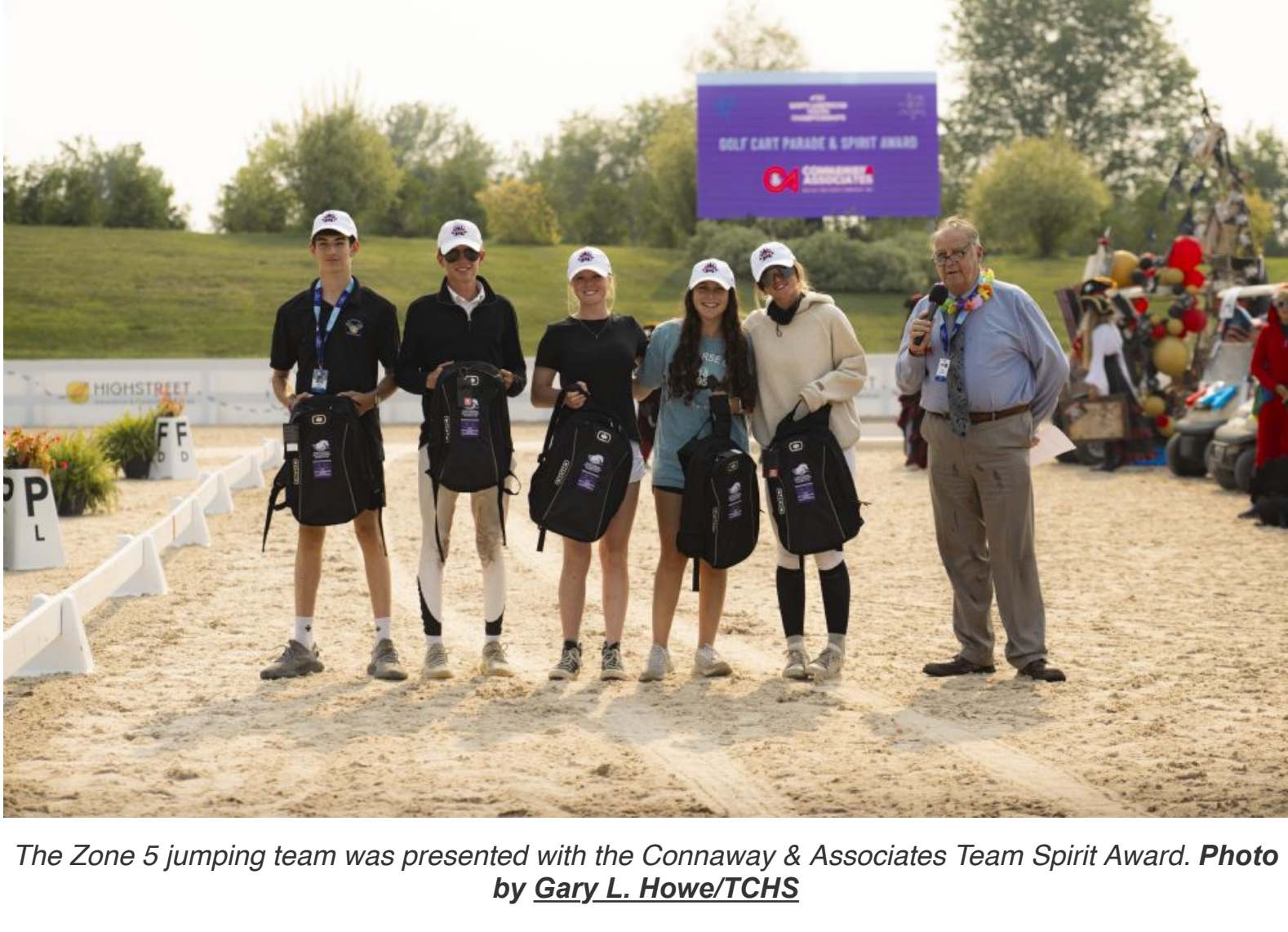
The Zone 5 jumping team was presented with the Connaway & Associates Team Spirit Award.

At the 2025 FEI North American Youth Championships (NAYC), which ran July 29 to August 3, in Traverse City, MI, teams in both dressage and jumping were rewarded for their positive, collaborative attitude and sportsmanship. The Connaway & Associates Equine Insurance Services Team Spirit Award was given to the combined dressage young rider team of Region 1/8 and the jumping junior team from Zone 5. Both teams demonstrated exemplary comradeship and unity as they cheered each other on.