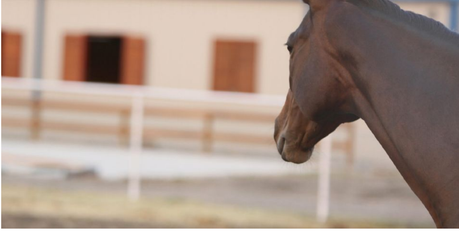
Equine businesses face unique liability risks, including injuries to both riders and horses, property damage, and professional liability. Learn what coverage would be best for your operation.

Here, we take a comprehensive look at what coverage you might need for your operation and break down equine insurance terminology to help you better understand your coverage options.